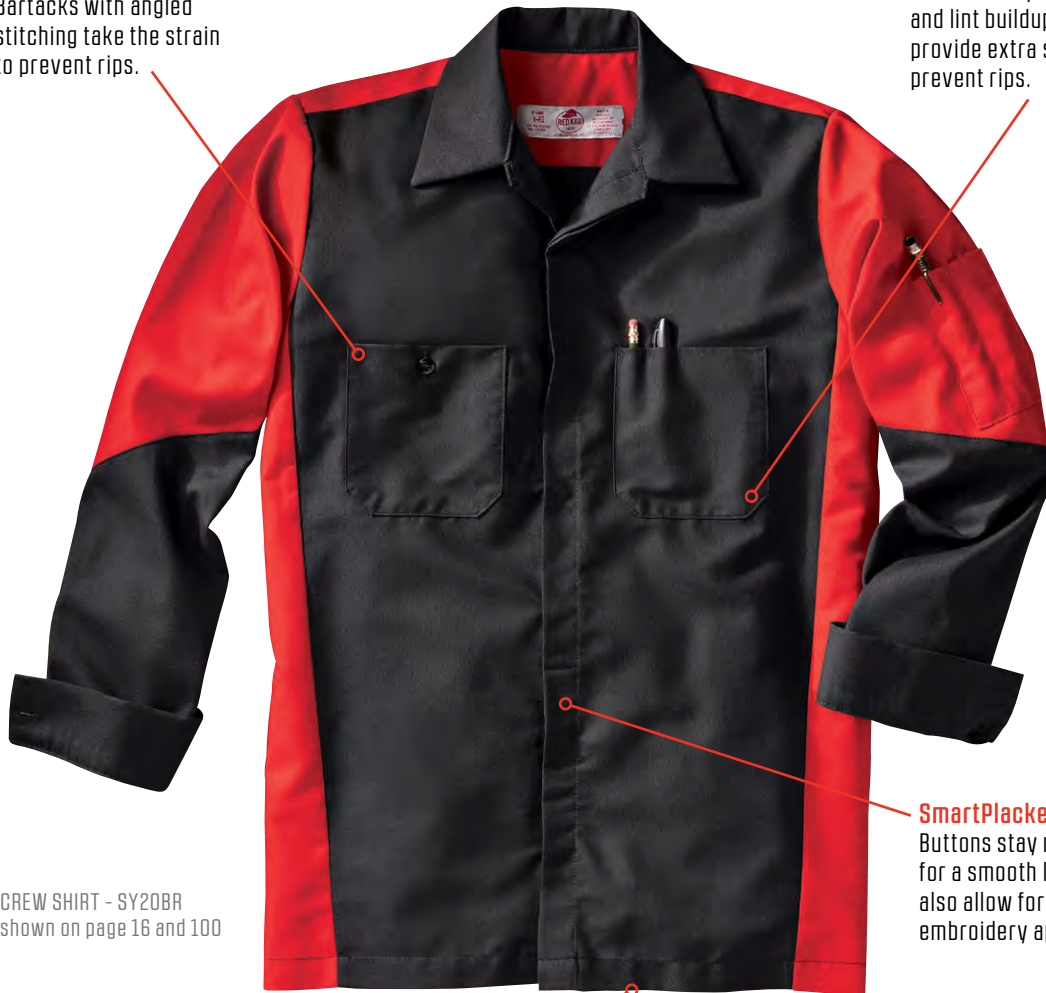
CREW SHIRT - SY20BR shown on page 16 and 100

Corner-free pockets resist dirt and lint buildup. Added bartacks provide extra strength to prevent rips.