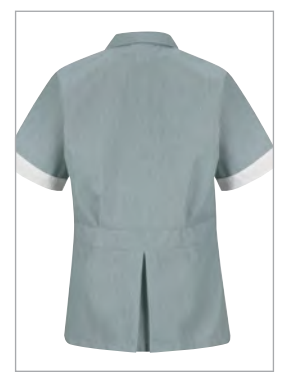
fixed belt with inverted back nleat detail