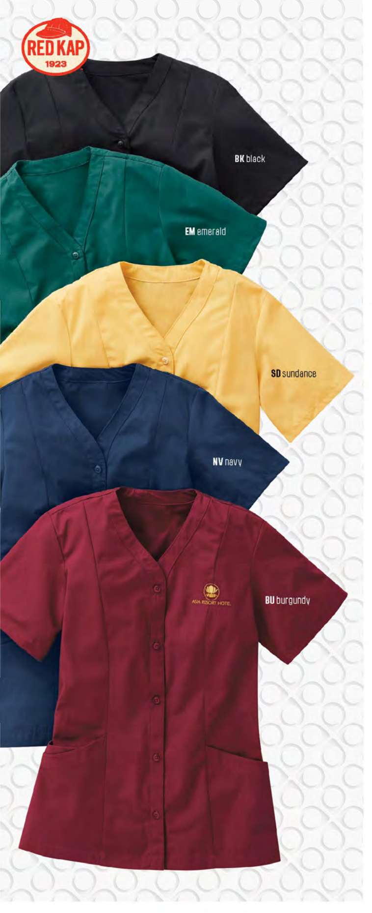
CUSTOMIZATION • Burgundy - logo embroidery on left upper front