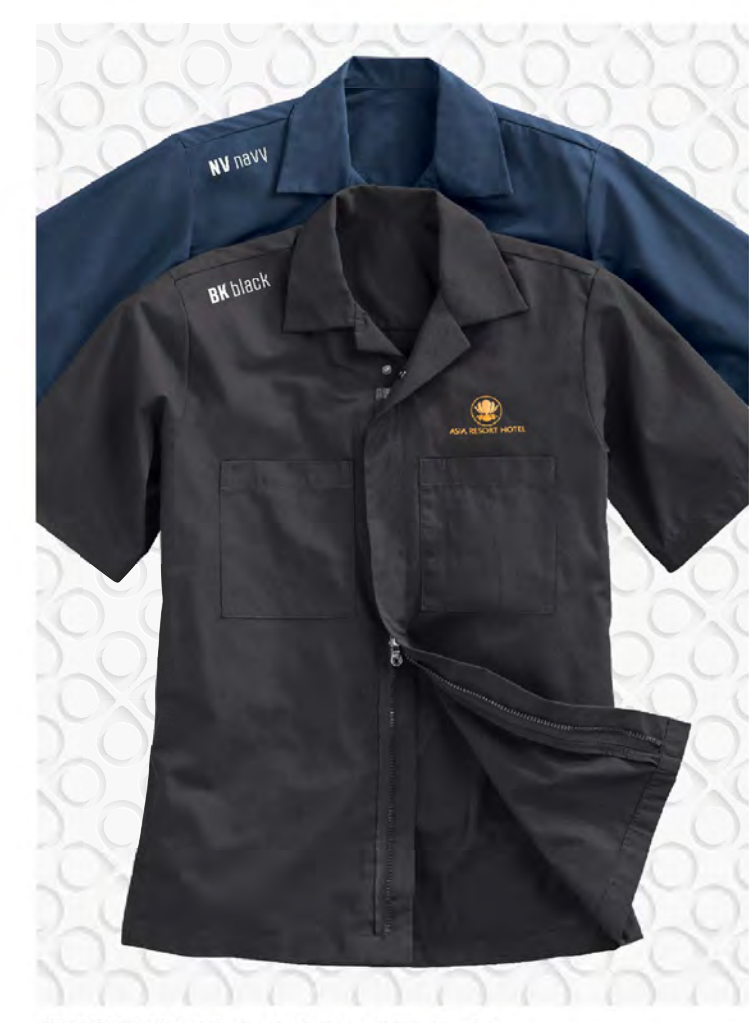
CUSTOMIZATION · Black - logo embroidery on left upper front