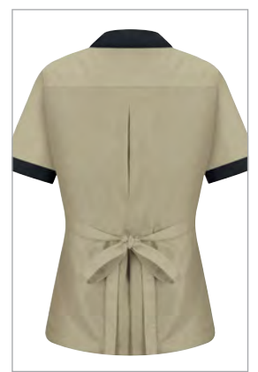
back inverted pleat