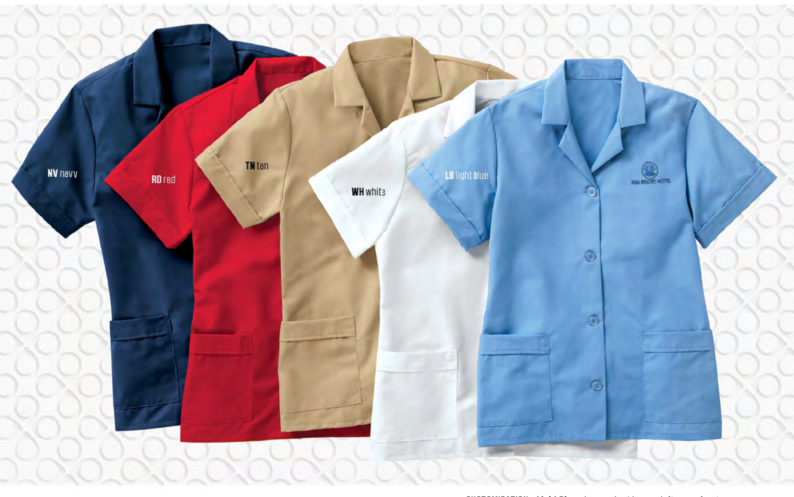
CUSTOMIZATION • Light Blue - logo embroidery on left upper front