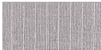
ripstop fabric detail