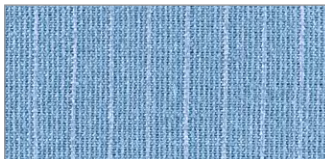
ripstop fabric detail