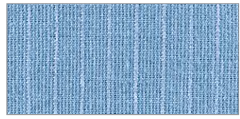
ripstop fabric detail