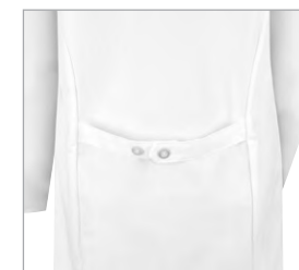
adjustable belted back and princess seams