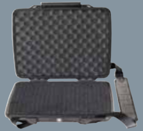
Pick N Pluck™ foam 1075, 1085 and 1095 (1075, 1085 and 1095 include strap)