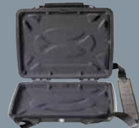
Padded foam liner 1055, 1065, 1075, 1085 and 1095