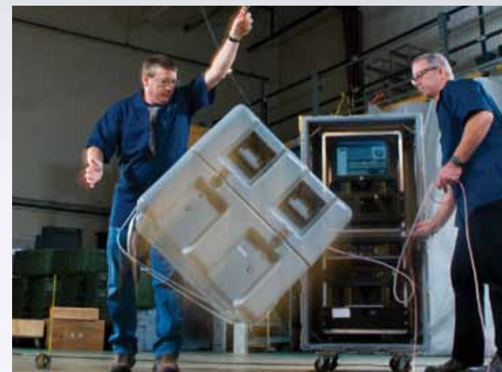
Our Cases are inspected and tested to ensure optimal performance in the field.

Pelican is a Worldwide company that can offer services around