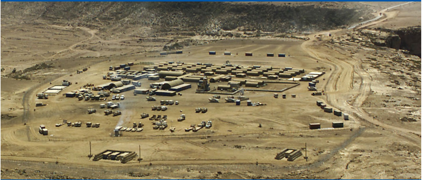
UN Camp in Eritrea