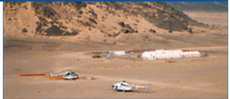
Desert Camp in Western Sahara

Weatherhaven construction and development camps can include accommodation, kitchens, dining halls, wash houses, offices, core shacks, recreation facilities, and medical shelters. These applications can be housed in our fabric shelters, expandable containers, or a combination of both.