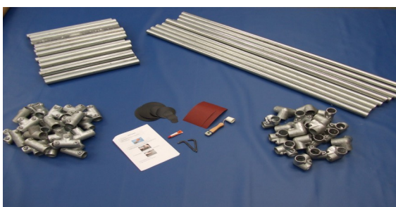
Repair kit & frame components