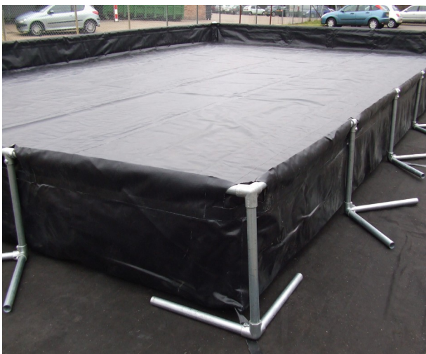
15m x 9m erected Berm