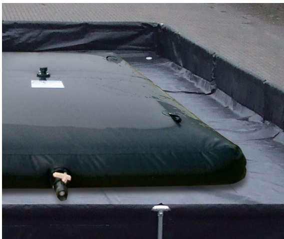
Berm holding a fuel bladder tank

The Portable Berm is part of a range of fuel storage and distribution products